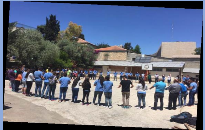
DSPR Galilee In Mee'lya Village with future leaders

A majority of student attendees are volunteering in school and community work. Students are more open to others of different backgrounds as friendships develop across the divides. Participating youth are active in seeing that the small scale projects in which they are involved are successfully implemented.