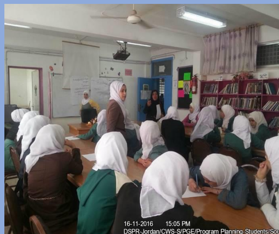
DSPR Jordan - Syrian Refugees – Women Health Discussion