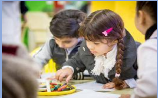
Gaza – Children Forgetting Everything Else

Gaza's prolonged unresolved conflict and political situation continue to have a negative impact on the social, cultural, and mental makeup of the Palestinian community. The conflict is creating a unique case of complex and chronic challenges that have caused beside economic disadvantages, personal stress, trauma and socio-cultural pressures in the war-impacted communities.