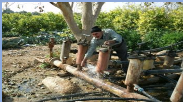
DSPR West Bank Farmer at Nwe'meh Village

In addition, the prompt intervention prevented losing the well due to