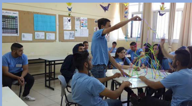
DSPR Galilee Empowering Young Students with Skills at ACRE

DSPR Galilee continued its support and involvement in ACRE Center for school dropout girls. 82 school girls were reached and they were cared for in the center together with enabling them to learn vocational skills that would boost their self-respect and morale. Most of the girls in 2016 rejoined their schools but some opted to become independent and to chart a course of establishing their own business.