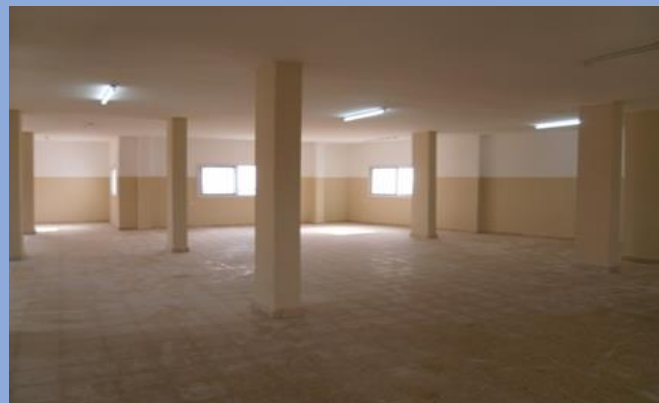
DSPR West Bank Al Aqaba Village Herbal Space

Al Aqaba factory herbal product is a unique brand from Palestine which has great potentials with limited resources. The factory is there, rural women society highly cooperative and active. Factory has a limited absorption and production capacity. Market demand is available with limited market supply. The project is implemented at 2 stages the first being the provision of storage and working space and the second would be to enhance agriculture production in the same locality. Rural women society share contribution was 14 % of the total actual cost of the project, contributing to a 380 m 2 for the preparation phase of herbs as well as storage of the final product. The additional space will enable absorption capacity of the delivered raw product, enable increased production, thus creating additional job opportunities. This will enhance the herbal value chain of a Palestinian brand for internal and external markets.