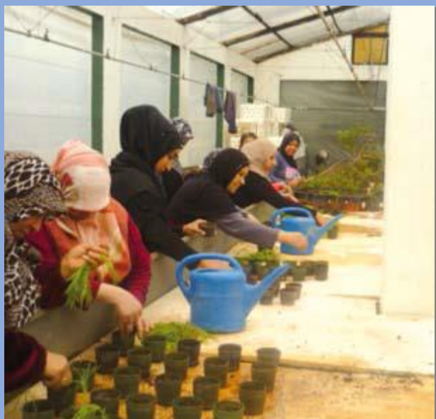
DSPR Lebanon Tyre Farm