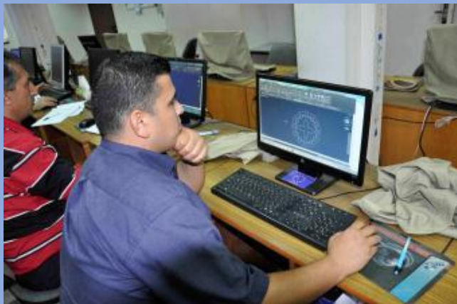
Gaza – Students at the AutoCAD Course

DSPR Gaza continues to offer at its Secretarial Studies and English Language Center a one year intensive course to young women who have finished their secondary studies (Tawjihi) to prepare them for secretarial positions. The course starts with an intensive English Language course running for 3 months. The 22 women enrollees in 2016 were provided with high quality secretarial skills that cover theoretical and practical lessons in the areas of English language, Simple Bookkeeping, Management Principles, Arabic Correspondence, Office Practice, Arabic and English languages, and Typing. The quality of education in this program was maintained as in previous years and its success is shown by the employment rate of our Secretarial Studies course.