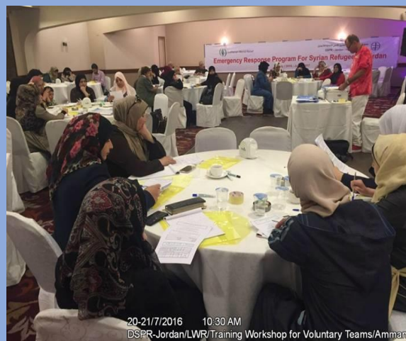
DS Jordan – Togetherness of Syrian Women Responding the Emergency