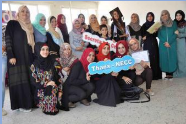
Gaza - Students of Dressmaking and Secretarial Studies Receiving their Degrees

The Advanced Dress Making Center offered a one year course to 24 young women in 2016. The graduates usually go on to support their families and to become financially independent. The students are provided with comprehensive Course covers theoretical and practical subjects including Measurement, preparing patterns and sewing of all kinds of dresses for children and adults mainly for women and produce well-prepared pieces.