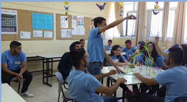
DSPR Tutoring and Caring