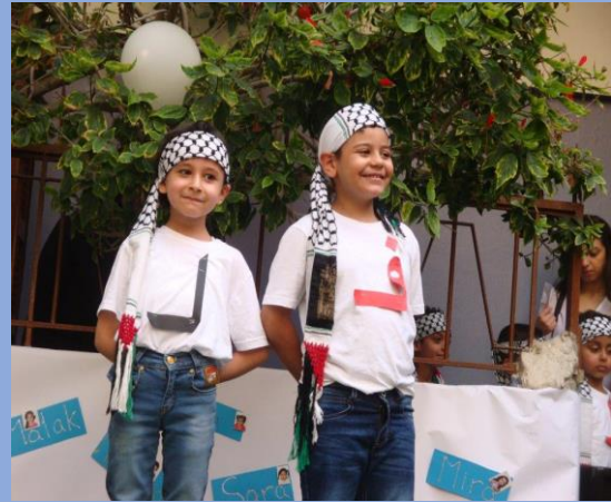
DSPR Lebanon Identity Formation at Sabra Kindergarten

The variety and extent of the workshops, activities, and opportunities do lead to an improvement in the holistic well-being of the individual and the community. Beneficiaries learn to take care of themselves and others, develop social skills and creative ability. This is important in a context that marginalizes the Palestinian refugees and puts them on the periphery in practically a majority of spheres.