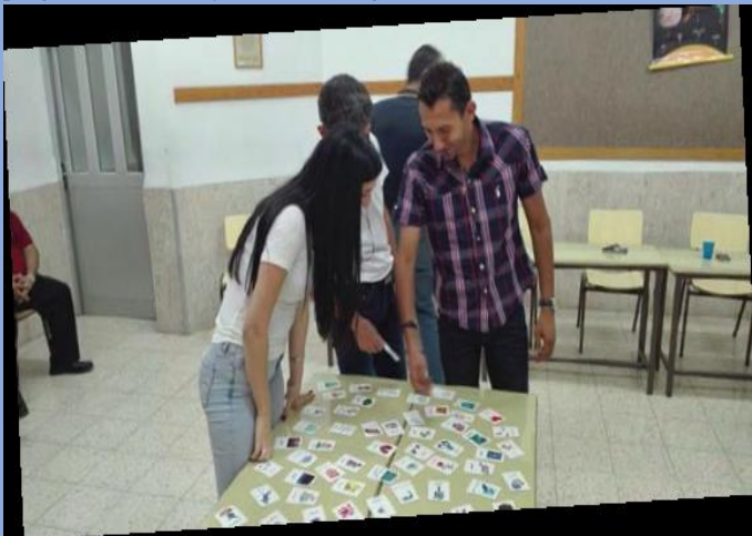
DSPR Galilee Interfaith Activity

The teachers and principals represented schools from mixed Arab villages in Galilee: Cana and Reineh besides the town of Nazareth. The sessions were held at The Franciscan School in Cana. An intensive course of 30 hours started on end of October till December. The course included 4 theoretical sessions 4 hours each, and 3 full day visits, 6 hours each to holy sites of Christianity, Islam, Druze and Judaism. The course was approved by the Ministry of Education- Northern District. Follow- up: during the year 2016-2017 the school teachers who participated in the program will convey this knowledge to their students.