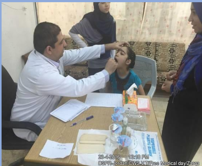
DSPR Jordan – Free Medical Day

A hundred Syrian refugee women and children on monthly average were checked at the clinic free of charge.