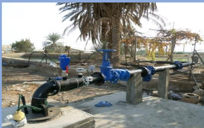
DSPR West Bank Pumping Station at Nwe'meh Village

collapsing its sides and the well is functioning efficiently and effectively at pumping capacity of 80m 3 /hr.