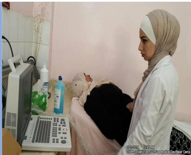
DSPR Jordan – During a Free Medical Day at Baqa camp

The health services offered include monthly health awareness sessions on a variety of medical, hygienic and nutritional topics with each of the sessions attended by at least 30 women. The holding of free medical days took place as in previous years at the DSPR Vocational Training Centers in Husn and Madaba ,Souf ,Amman refugee camps and other Palestinian and Syrian Refugees gatherings.. These 13 days covered gynecology, optometry, pediatrics and general medicine, among other medical needs of the population. They were attended by over 1000 women and other people seeking medical advice and assistance.600 Syrian refugees were referred for further medical treatments throughout the year.