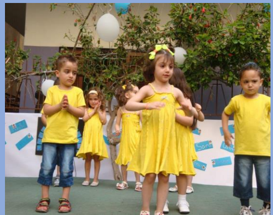
DSPR Lebanon – Like in Other Lands, Children are Children.