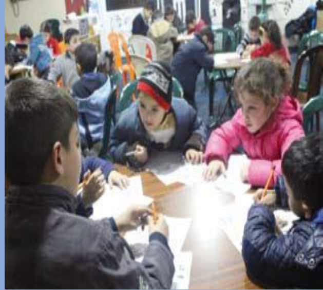
DSPR Lebanon Dbayeh Refugee Camp