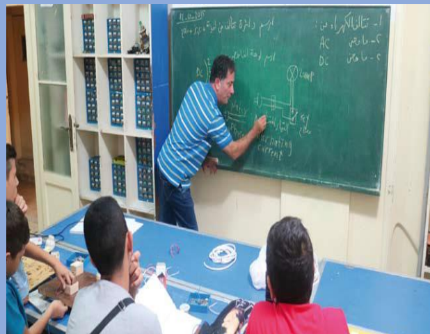
DSPR Lebanon TV School

Learning a skill, no matter how simple or complicated, is the way to help trainees find and realize their own potential, develop their self confidence in looking for jobs, establish their own small business, at-home or in the community. This is especially important at a time when Palestinians in Lebanon are not allowed to work in at least 70 occupations and professions and face constraints in accessing the Lebanese labor market. Special mention is of the Agricultural course at the Tyre farm where trainees are introduced to the good earth and develop their own farming skills. Seeing the produce of work on the land and tasting it is an encouragement to practice farming and to appreciate the bounties that come from hard work on the land.