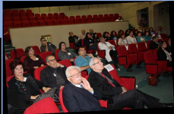
DSPR Galilee Intergroup Audience in the December Conference

The Conference was a success by all means as it led to exchange of knowledge and to sensitizing some in the medical, civil society organizations and professionals in various fields, both Arabs and Jews, to the special challenges facing Arab children in the country.