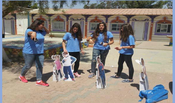
Girls in ACRE learning Togetherness

Altogether some hundreds of youth and children, of both gender, benefited from these programs in 2016. Childhood Development was the focus of activities in the Refugee camps of Jordan. Focusing on Syrian refugee children 16 Forums were established that reached out to 640 children aged between 8 to 12 years. There were also 24 training workshops conducted on the promotion of girls' education that were attended by girls and their mothers as well.