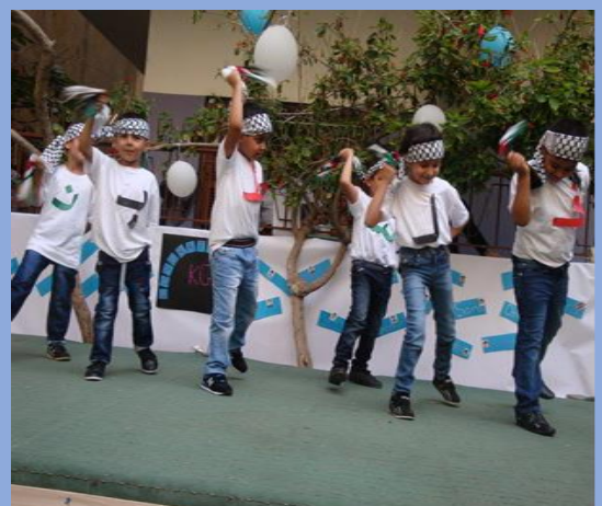
DSPR Lebanon – Children Enjoying Being Themselves