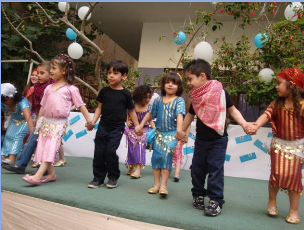
DSPR Lebanon the Children of Sabra Refugee Camp Kindergarten

As the above list details, hundreds of participants in a variety of activities that offer health lectures, discussion, workshops and trainings to women, men, and youth on a wide variety of health-related topics including, healthy eating, the effects of smoking, alcohol, and drugs, causes and caring for diseases, sex education, hygiene, dental care and emotional health.