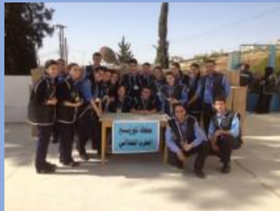
DSPR Jordan Syrian Refugees – Food and Non-Food Items