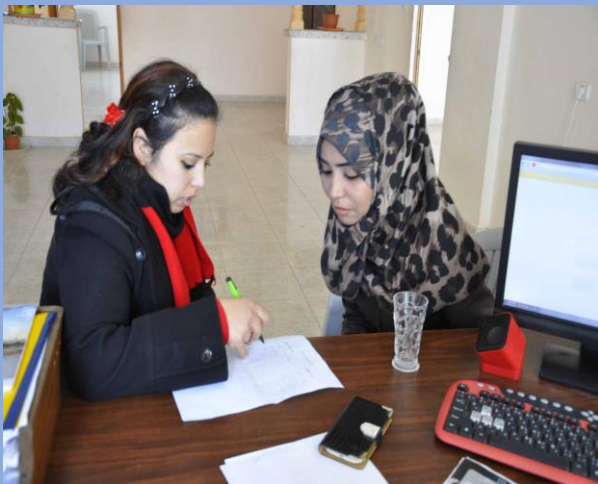
DSPR Gaza Job Creation as Emergency Intervention