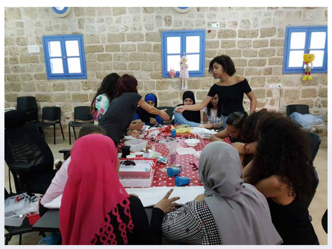
Acre Girls Together Working to Go Back to School

Strip coordinated through a Central Office located in East Jerusalem. DSPR is an Ecumenical Church Related Organization. It reflects the core values in its witness and diakonia in partnership with local and global actors. Its aim is to foster and advance socio-economic conditions of Palestinians and marginalized communities through provision of health care, education, social programming and empowerment.