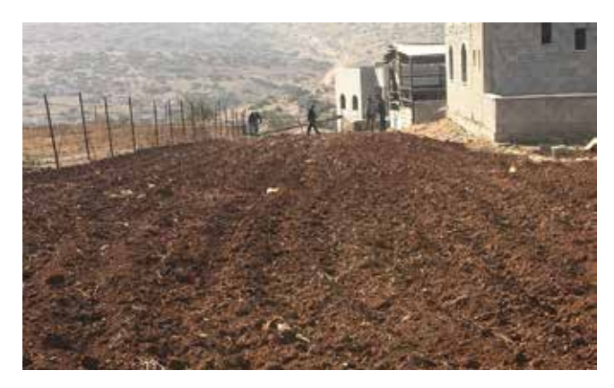
Tilling the ground for herbal planting – Always a work of love and identification