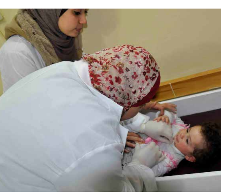
Following up on a Gaza baby with caring hands

Overall, DSPR Gaza reached to 38,335 children in the three primary health clinics. Of the 1557 Gaza babies and children under 6 years of age tested positive for anemia, malnourishment, wasting, underweight and stunting, the average recovery rates within 120 days of treatment were as follows: 70% for anemia; 87% for wasting; 67% for underweight and 54% for stunting. DSPR medical and social services staff members saw to it that the affected children received the needed treatment