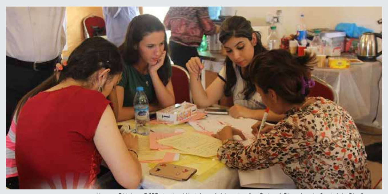
Young Girls in a DSPR Jordan Workshop Addressing the Role of Churches in Society's Challenges

Objective: DSPR is financially sustainable