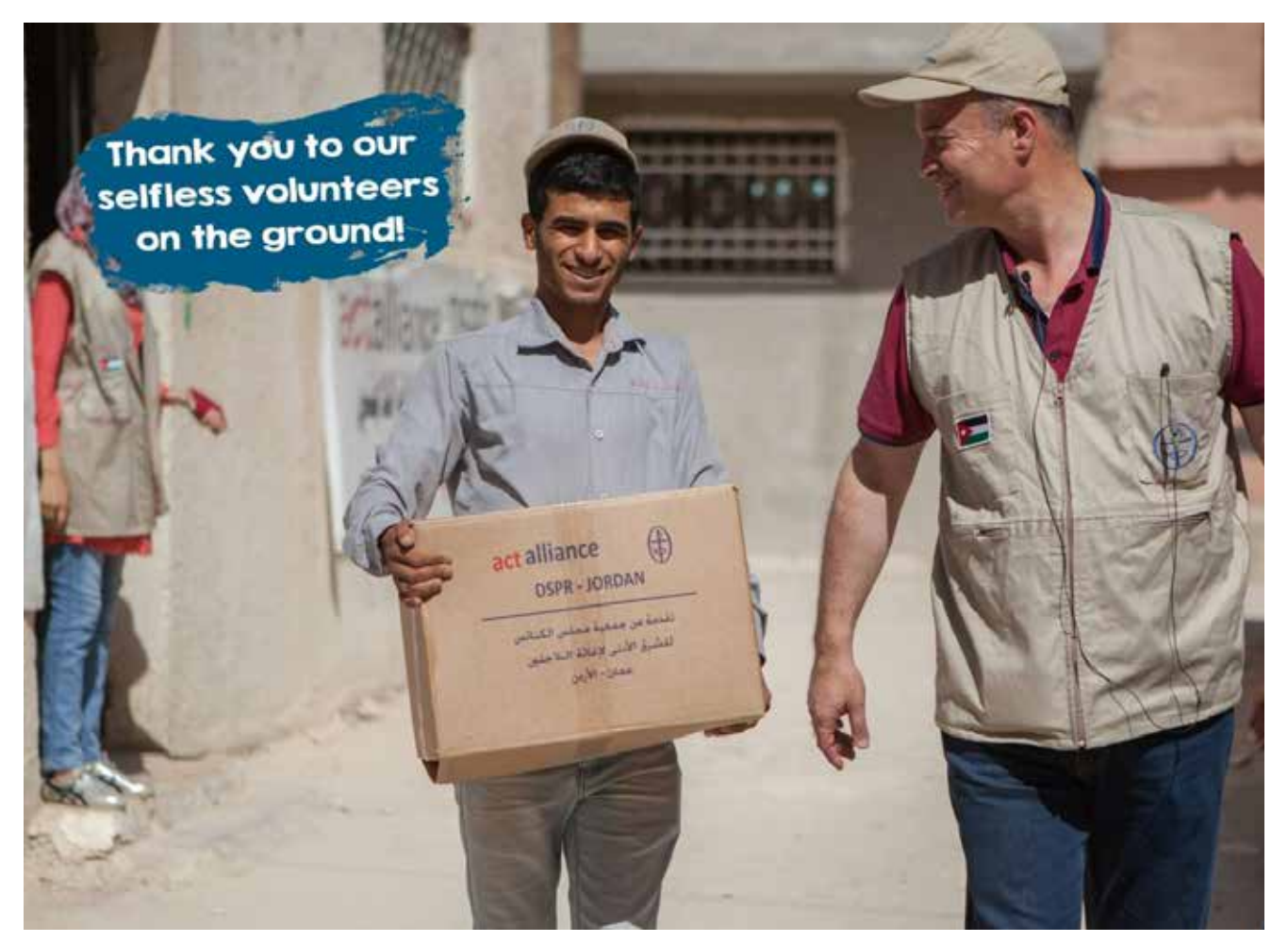
ACT Alliance Food Relief Package Carried by Jordan Volunteer and the Executive Director to a Syrian Refugee Family.

Food parcels and winter blankets for infants and children were distributed to over 10,000 families (Jordan and Lebanon), stationary kits for school were offered to over 4000 students (Jordan), where 32 forums focusing on hundreds of children were established. Over 962 Syrian students not absorbed in the official public Lebanese schools were provided with the appropriate education that would see them sit successfully for the official exams in Damascus (Lebanon).