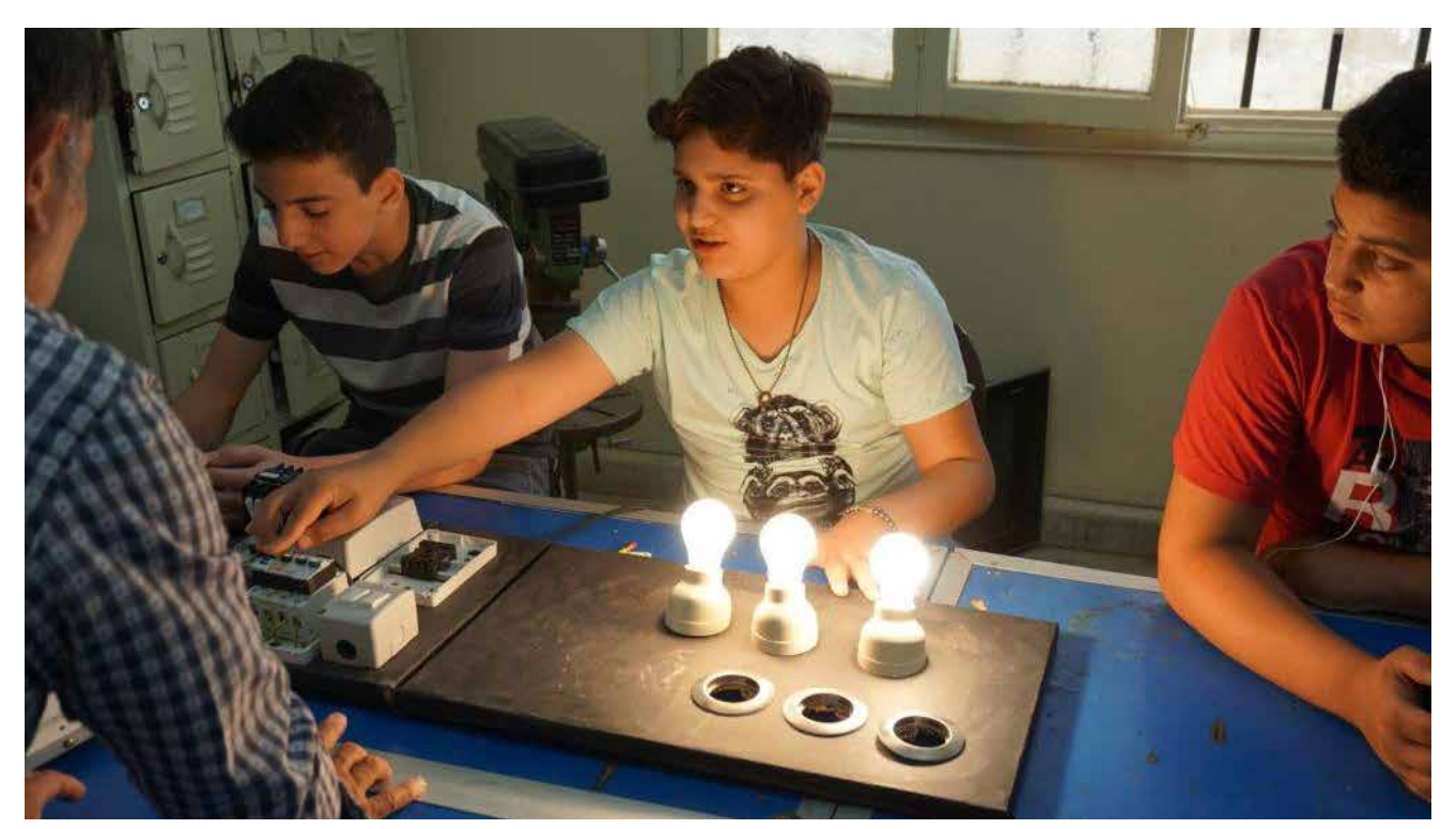
Omar Lebanon Overcoming

60 children are enrolled in the Sabra refugee camp Pre-School in Lebanon. All toddlers are given individual attention. Those screened for special needs are given additional attention and followed up closely on their progress. The Sabra Pre-School kindergarten has been operating since four decades and generations of families have used its premises as a basis for going on with schooling and helping parents, both Moms and Dads, to seek employment. Success story from the JCC Kindergarten