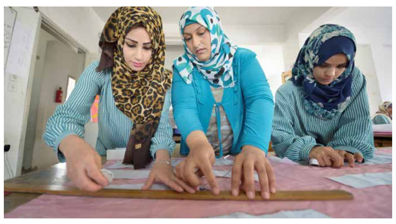
DSPR Gaza Women at Design Coaching in the Dressmaking Vocational Training

Objective - Refugees and vulnerable communities can sustain themselves economically