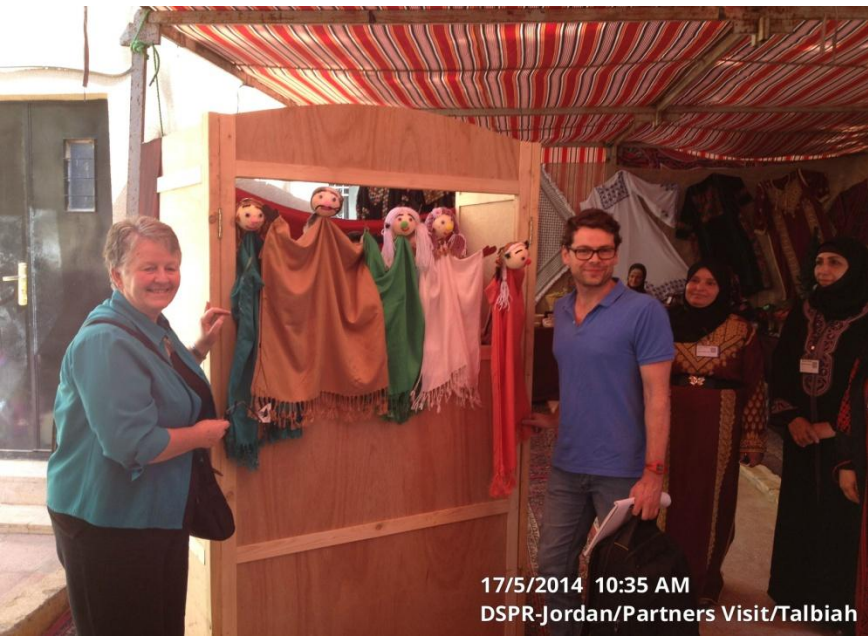
17/5/2014 10:35 AM DSPR-Jordan/Partners Visit/Talbiah