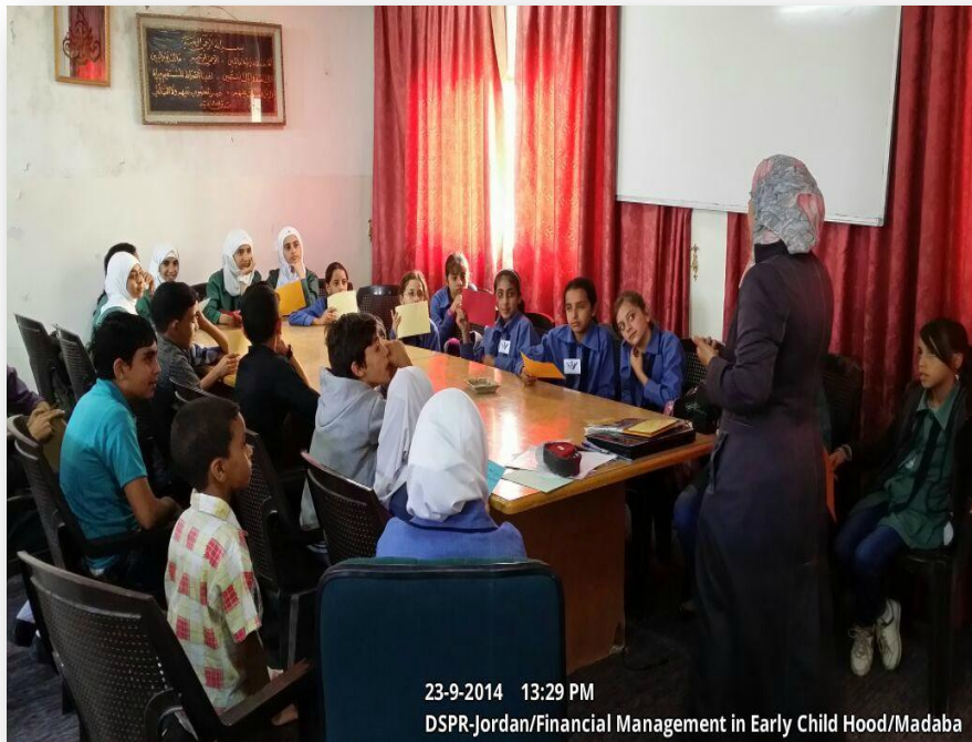
23-9-2014 13:29 PM DSPR-Jordan/Financial Management in Early Child Hood/Madaba