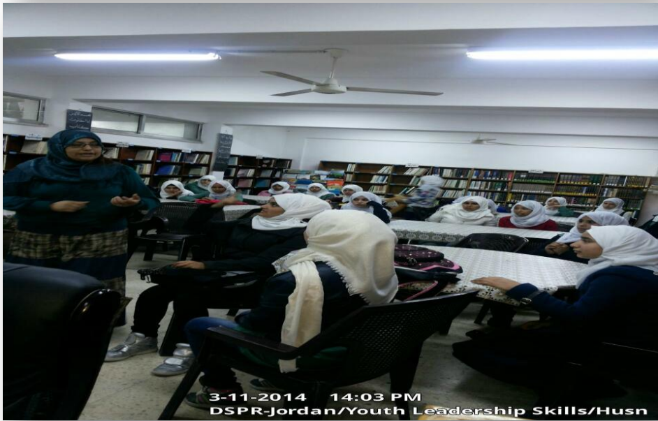
3-11-2014 14:03 PM DSPR-Jordan/Youth Leadership Skills/Husn