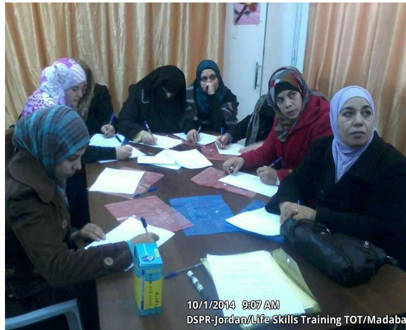
10/1/2014 9:07 AM DSPR-Jordan/Life Skills Training TOT/Madaba