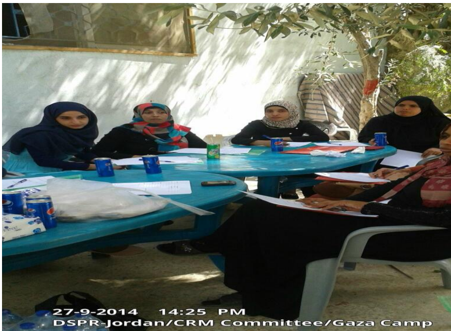
27-9-2014 14:25 PM DSPR-Jordan/CRM Committee/Gaza Camp