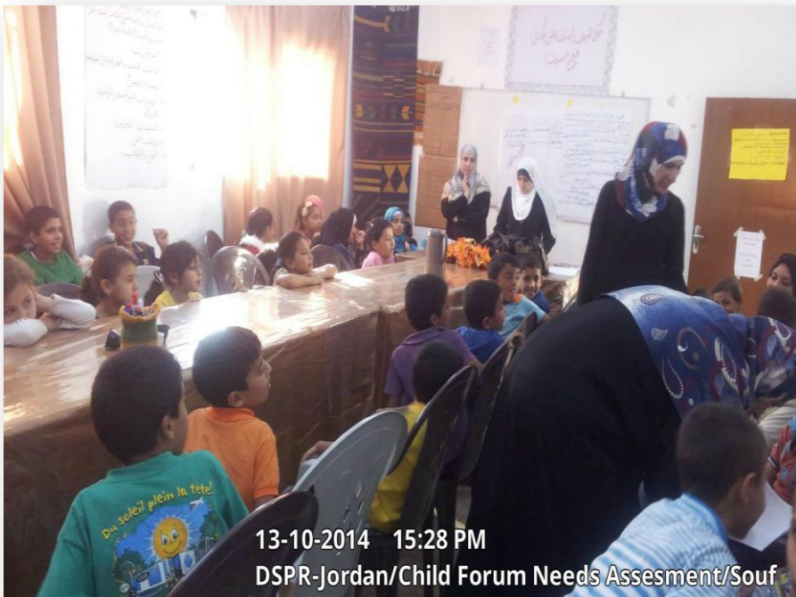
13-10-2014 15:28 PM DSPR-Jordan/Child Forum Needs Assesment/Souf