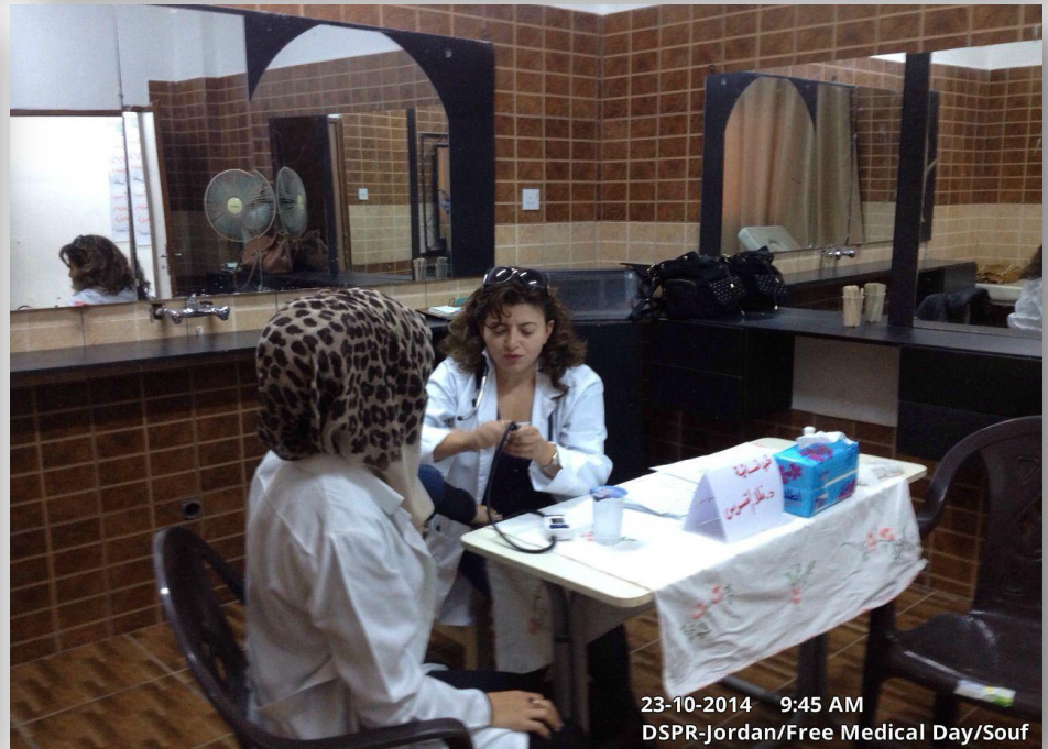
23-10-2014 9:45 AM DSPR-Jordan/Free Medical Day/Souf