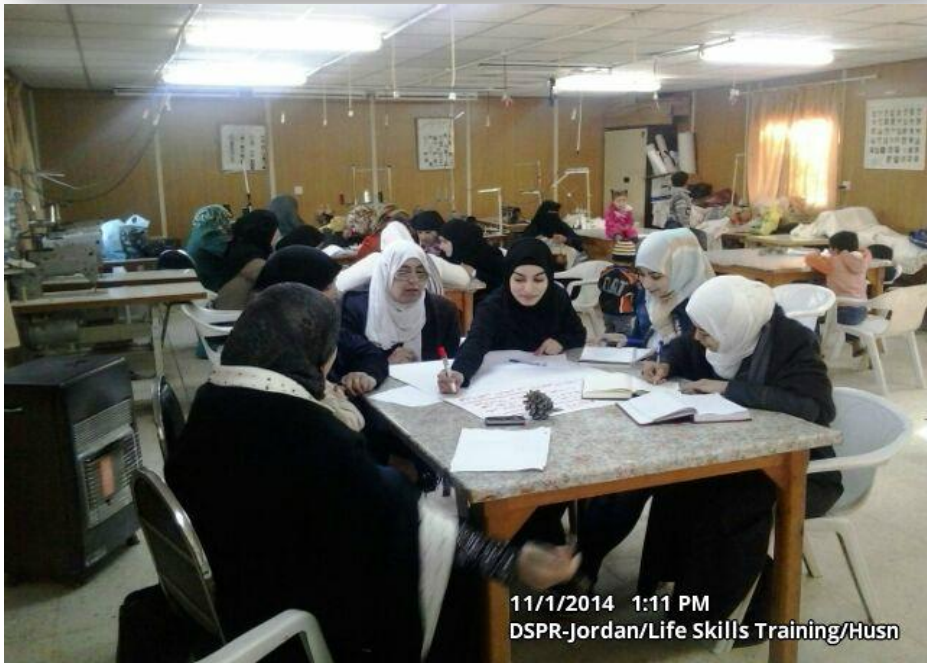
11/1/2014 1:11 PM DSPR-Jordan/Life Skills Training/Husn