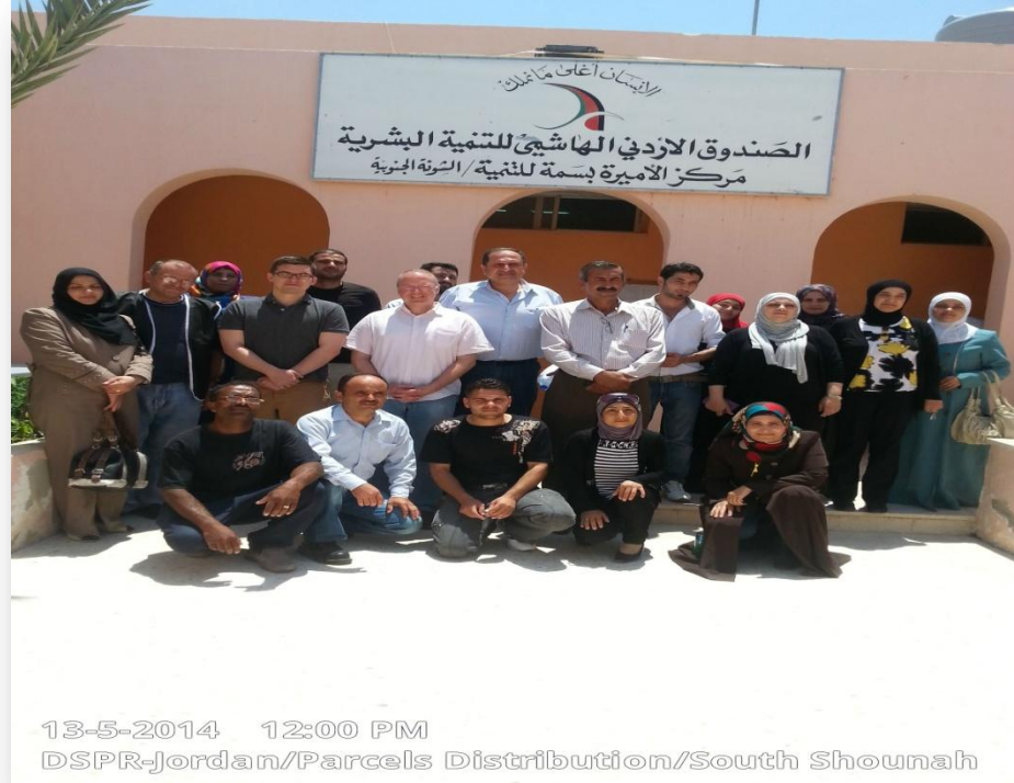
13-5-2014 12:00 PM DSPR-Jordan/Parcels Distribution/South Shounah