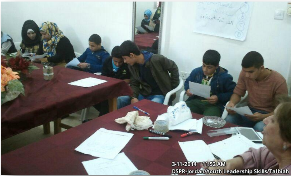
3-11-2014 11:52 AM DSPR-Jordan/Youth Leadership Skills/Talbiah