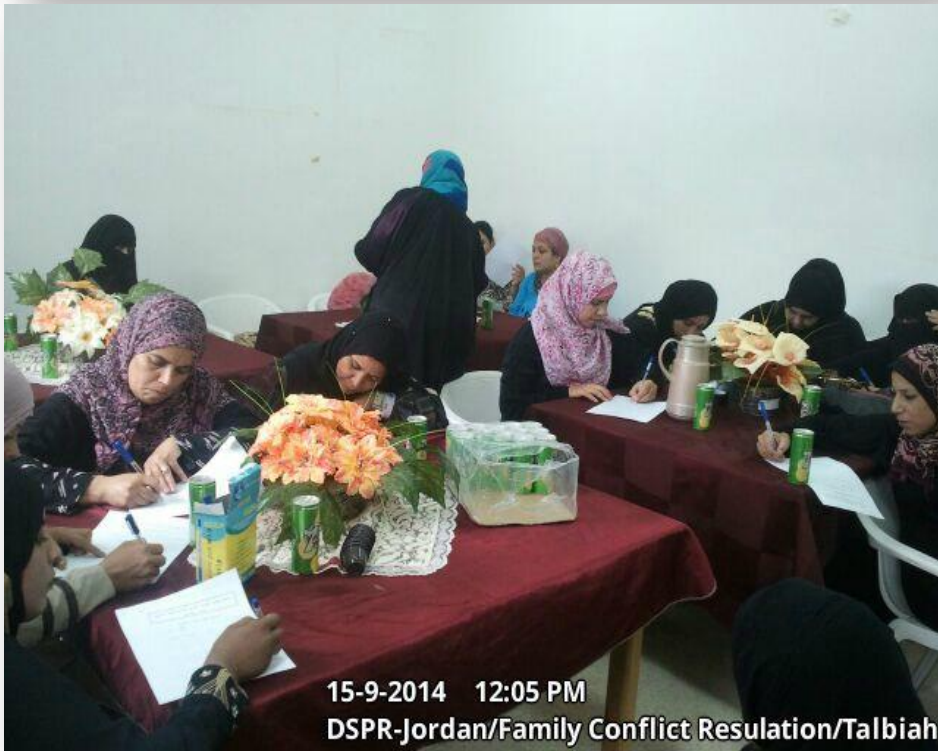
15-9-2014 12:05 PM DSPR-Jordan/Family Conflict Resulation/Talbiah