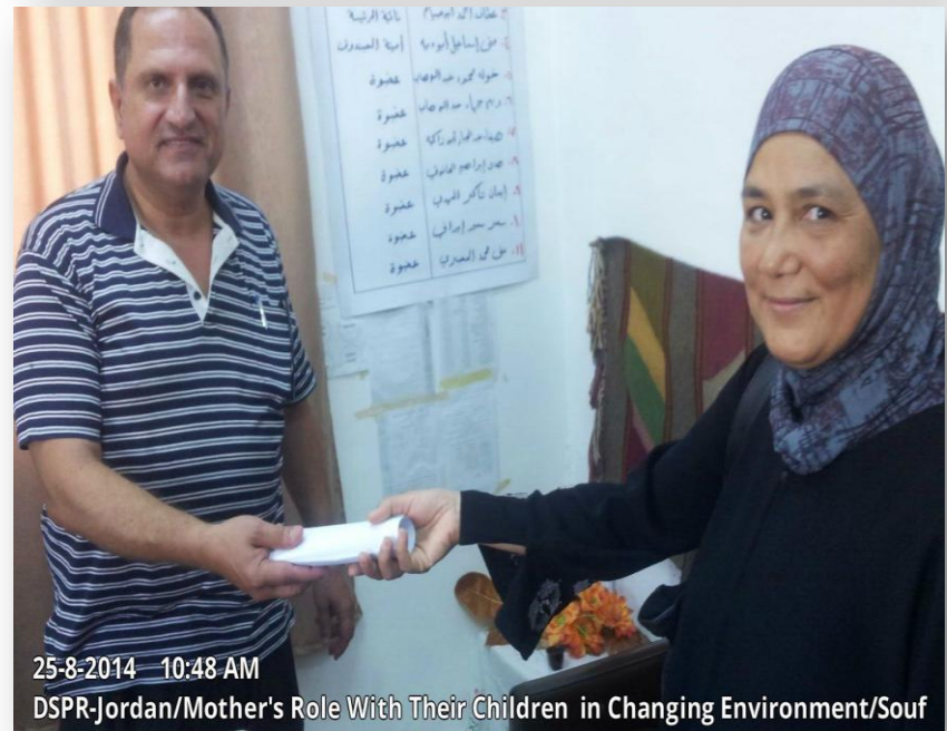
25-8-2014 10:48 AM DSPR-Jordan/Mother's Role With Their Children in Changing Environment/Souf