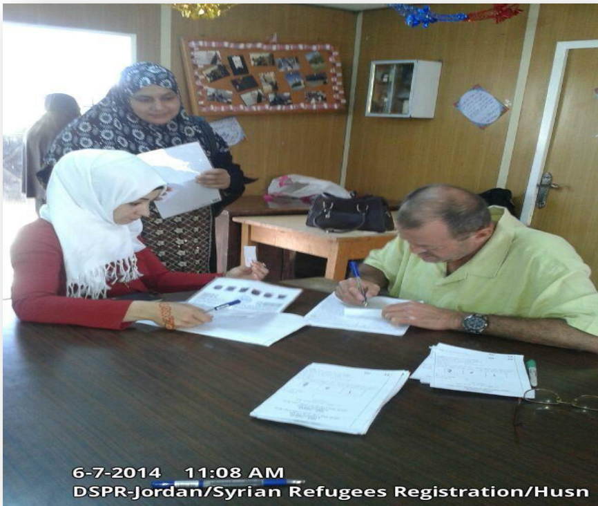
6-7-2014 11:08 AM DSPR-Jordan/Syrian Refugees Registration/Husn