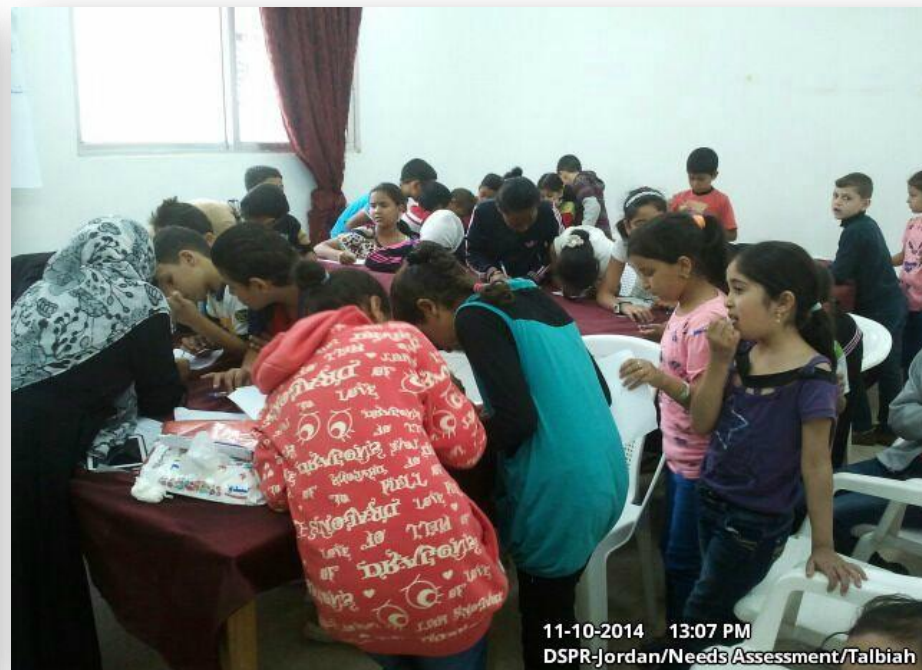
11-10-2014 13:07 PM DSPR-Jordan/Needs Assessment/Talbiah