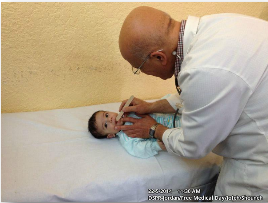
22-5-2014 11:30 AM DSPR-Jordan/Free Medical Day/Jofeh/Shouneh