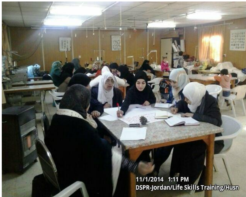
11/1/2014 1:11 PM DSPR-Jordan/Life Skills Training/Husn