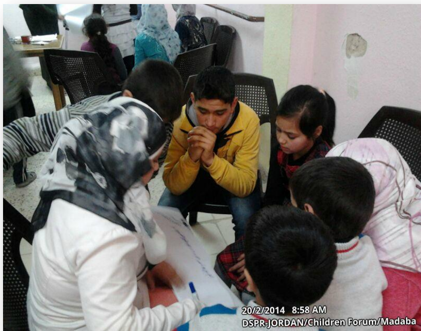
20/2/2014 8:58 AM DSPR-JORDAN/Children Forum/Madaba