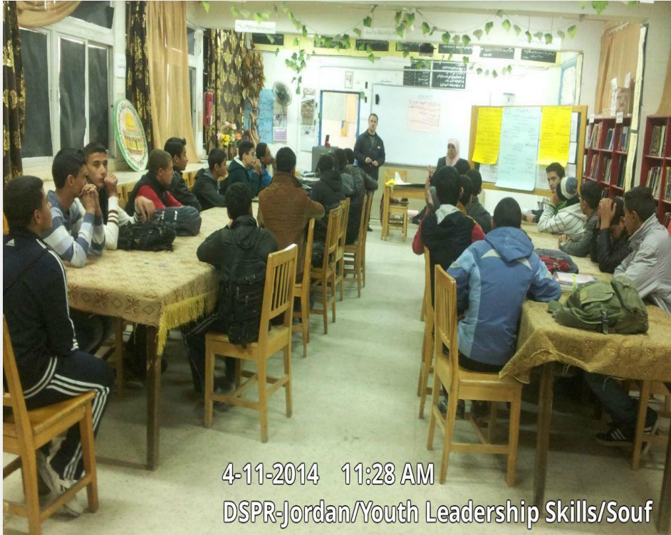
4-11-2014 11:28 AM DSPR-Jordan/Youth Leadership Skills/Souf