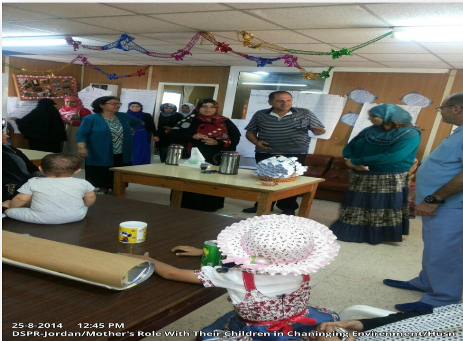
25-8-2014 12:45 PM DSPR-Jordan/Mother's Role With Their Children In Chaniging Environment/Husn