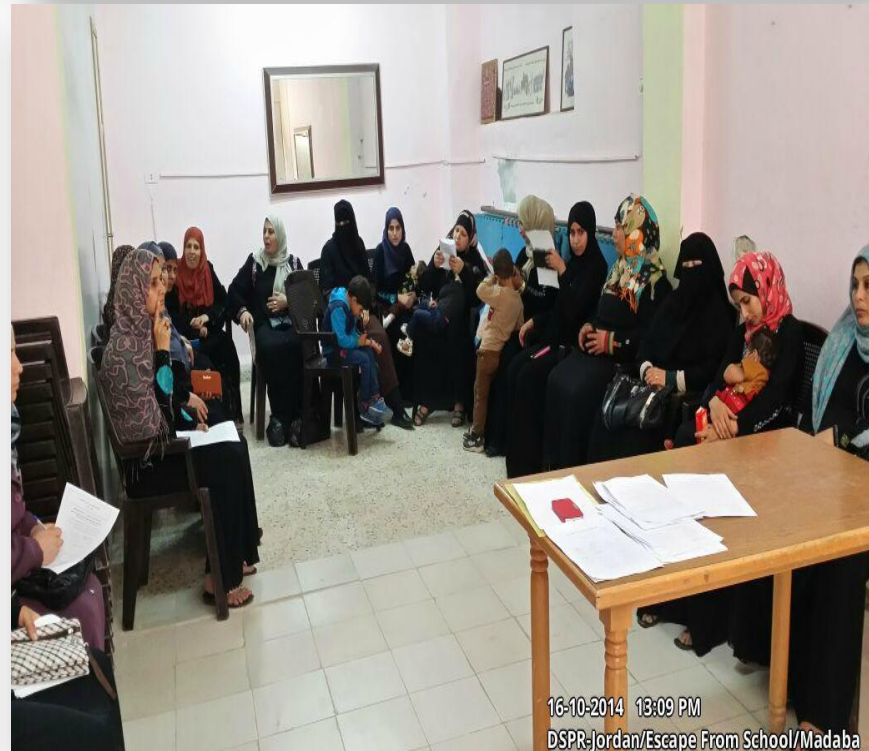
16-10-2014 13:09 PM DSPR-Jordan/Escape From School/Madaba