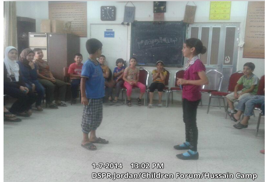
1-7-2014 13:02 PM DSPR-Jordan/Children Forum/Hussain Camp