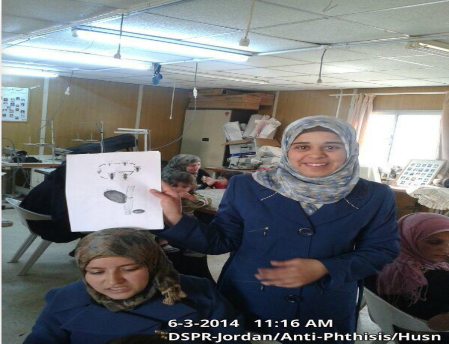
6-3-2014 11:16 AM DSPR-Jordan/Anti-Phthisis/Husn