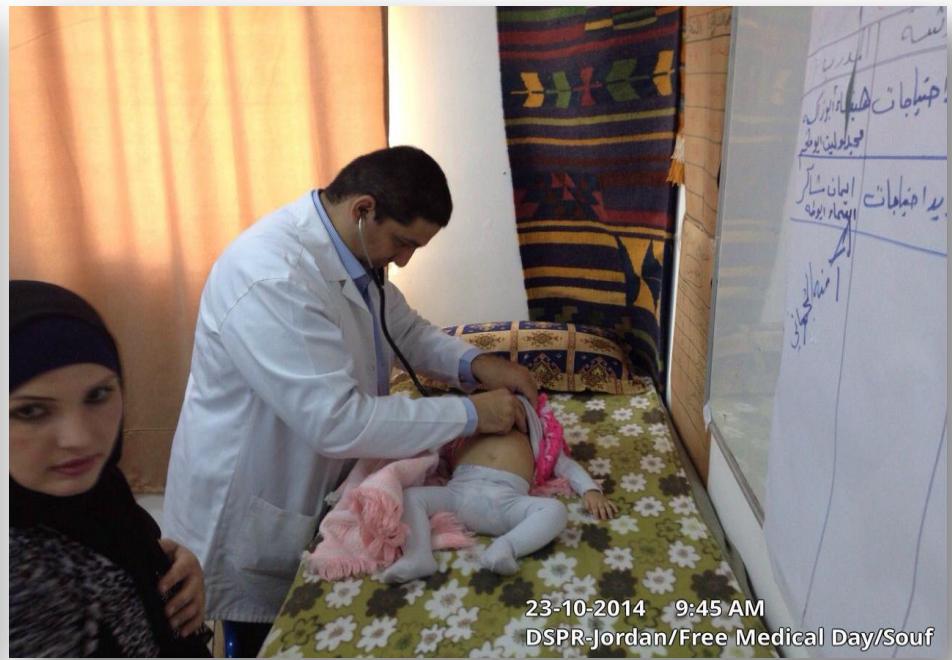
23-10-2014 9:45 AM DSPR-Jordan/Free Medical Day/Souf