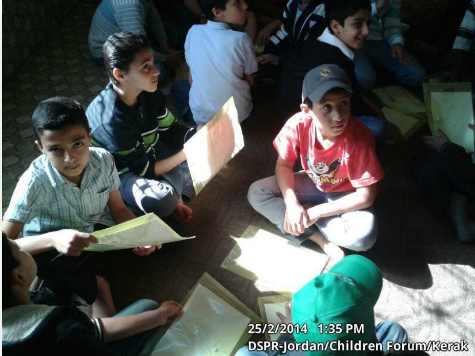
25/2/2014 1:35 PM DSPR-Jordan/Children Forum/Kerak