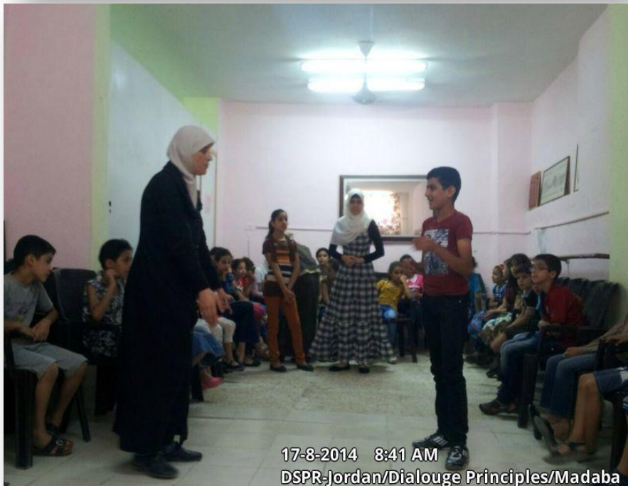
17-8-2014 8:41 AM DSPR-Jordan/Dialouge Principles/Madaba