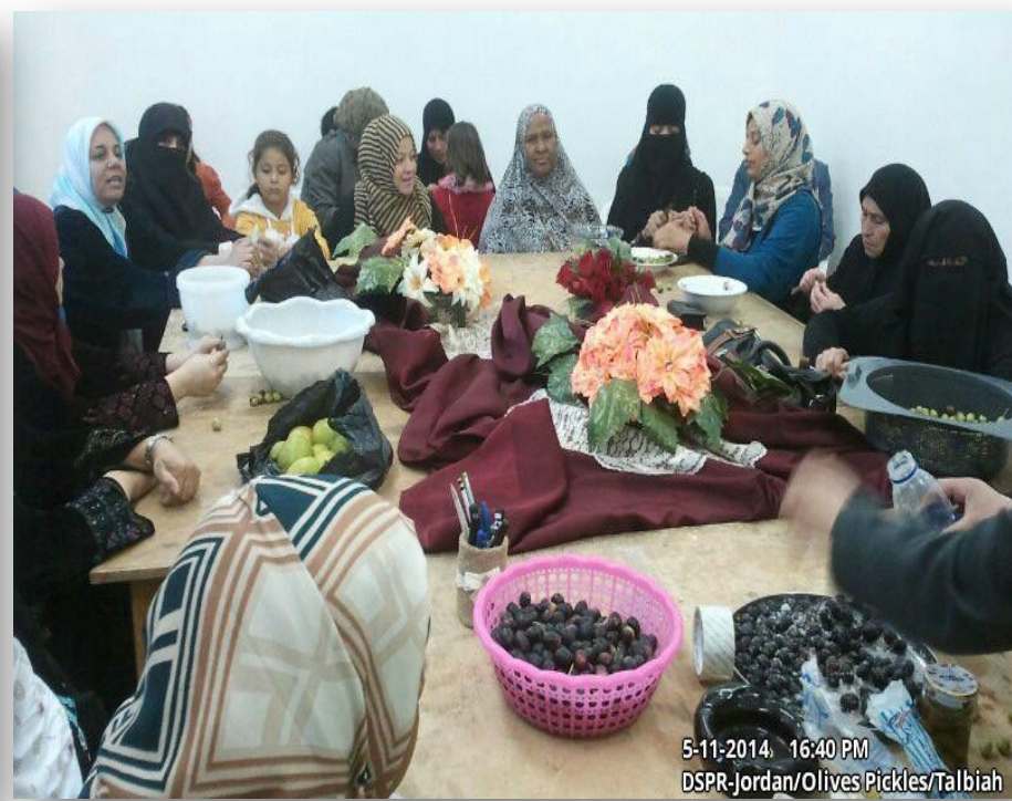
5-11-2014 16:40 PM DSPR-Jordan/Olives Pickles/Talbiah