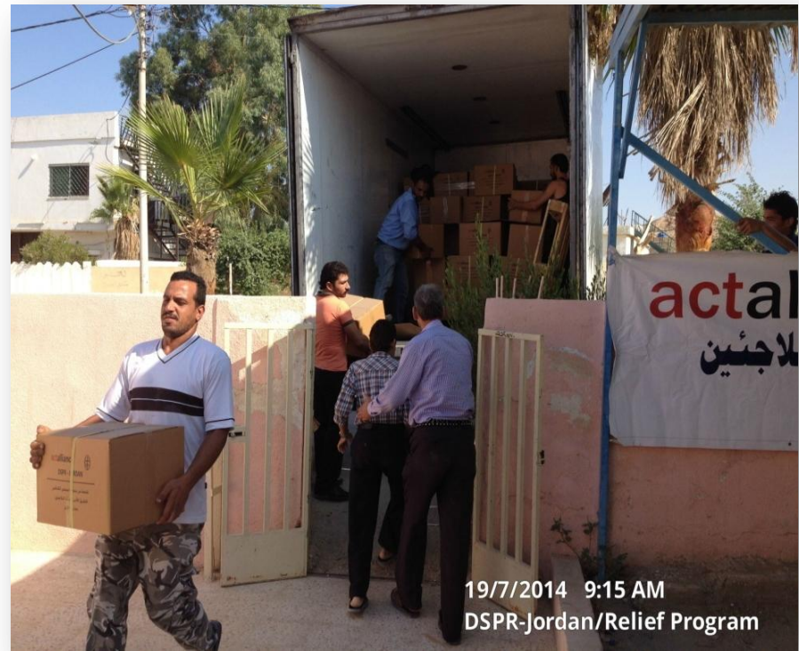
19/7/2014 9:15 AM DSPR-Jordan/Relief Program