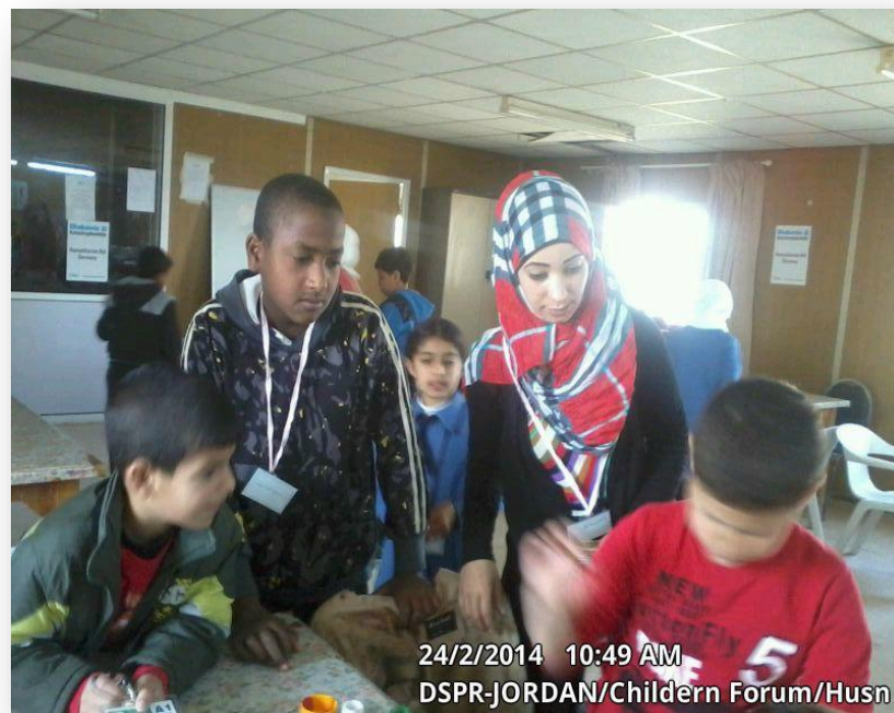
24/2/2014 10:49 AM DSPR-JORDAN/Children Forum/Husn