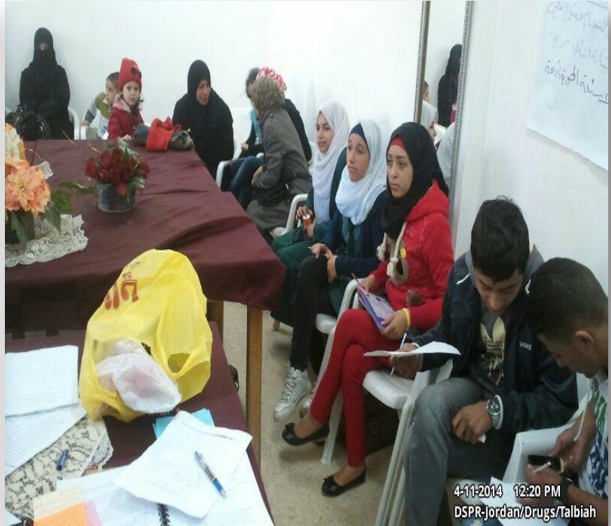
4-11-2014 12:20 PM DSPR-Jordan/Drugs/Talbiah