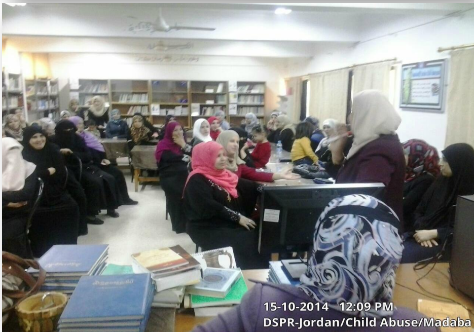
15-10-2014 12:09 PM DSPR-Jordan/Child Abuse/Madaba