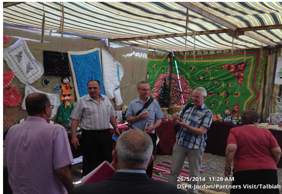
26/5/2014 11:28 AM DSPR-Jordan/Partners Visit/Talbiah