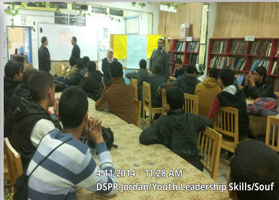
4-11-2014 11:28 AM DSPR-Jordan/Youth Leadership Skills/Souf