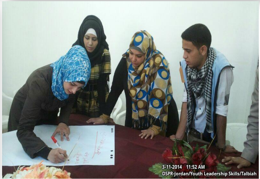
3-11-2014 11:52 AM DSPR-Jordan/Youth Leadership Skills/Talbiah