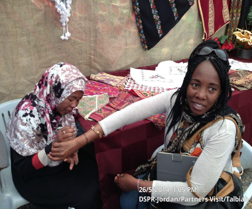
26/5/2014 1:05 PM DSPR-Jordan/Partners Visit/Talbiah