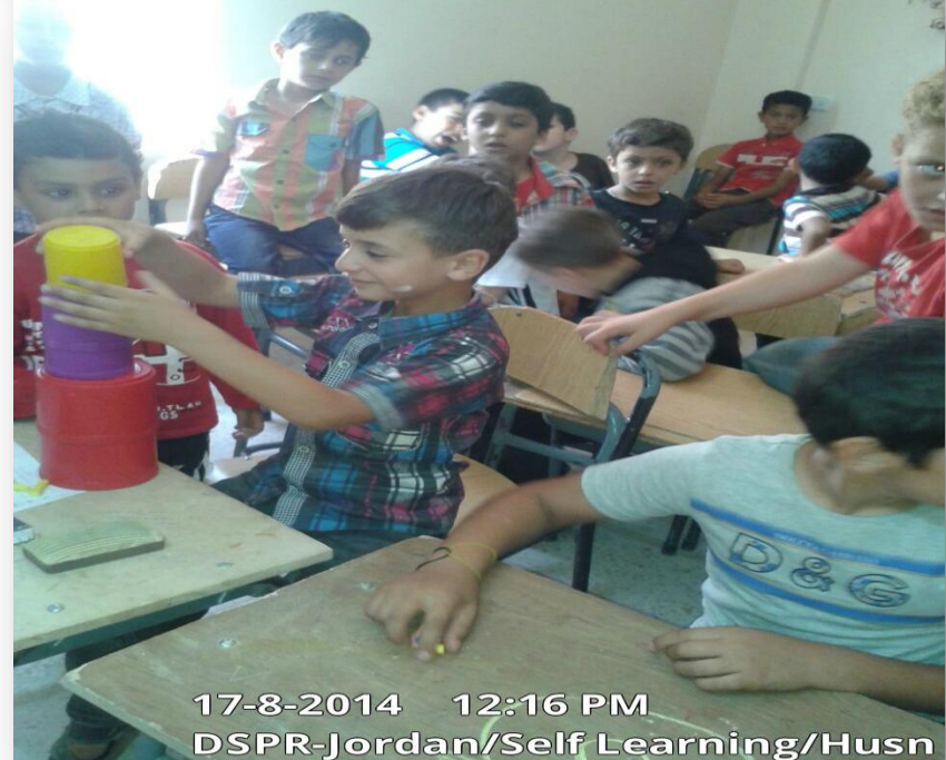
17-8-2014 12:16 PM DSPR-Jordan/Self Learning/Husn