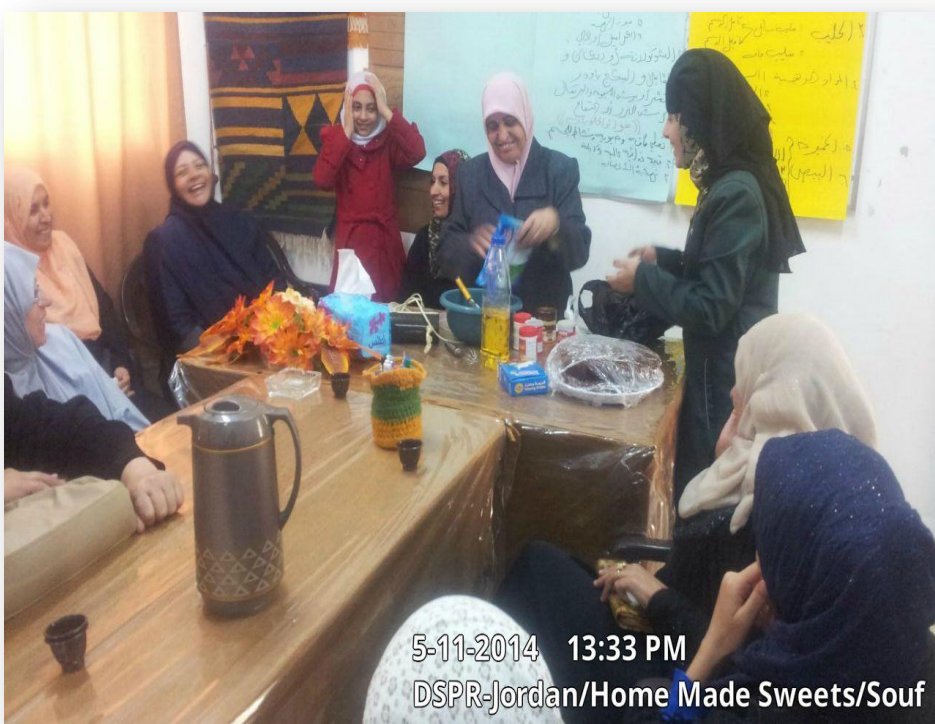
5-11-2014 13:33 PM DSPR-Jordan/Home Made Sweets/Souf