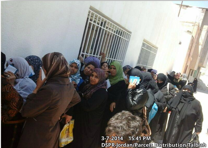
3-7-2014 15:41 PM DSPR-Jordan/Parcels Distribution/Talbiah