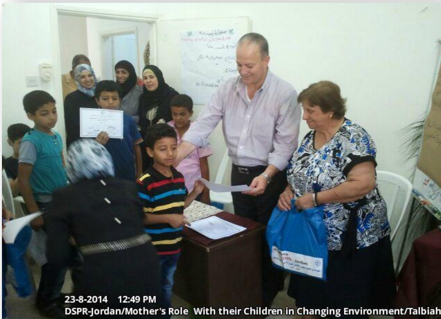
23-8-2014 12:49 PM DSPR-Jordan/Mother's Role With their Children in Changing Environment/Talbiah