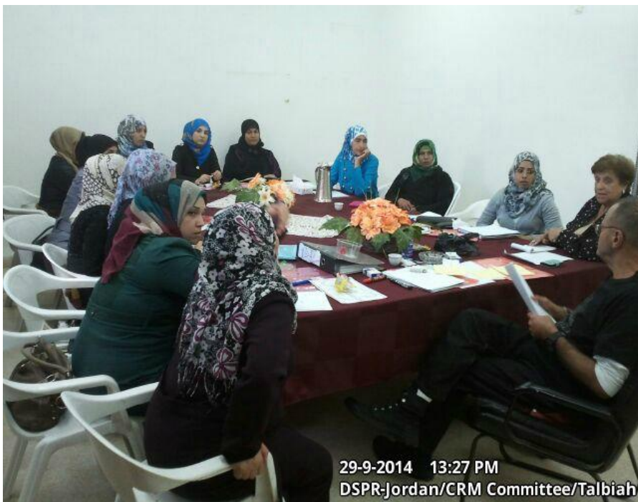
29-9-2014 13:27 PM DSPR-Jordan/CRM Committee/Talbiah