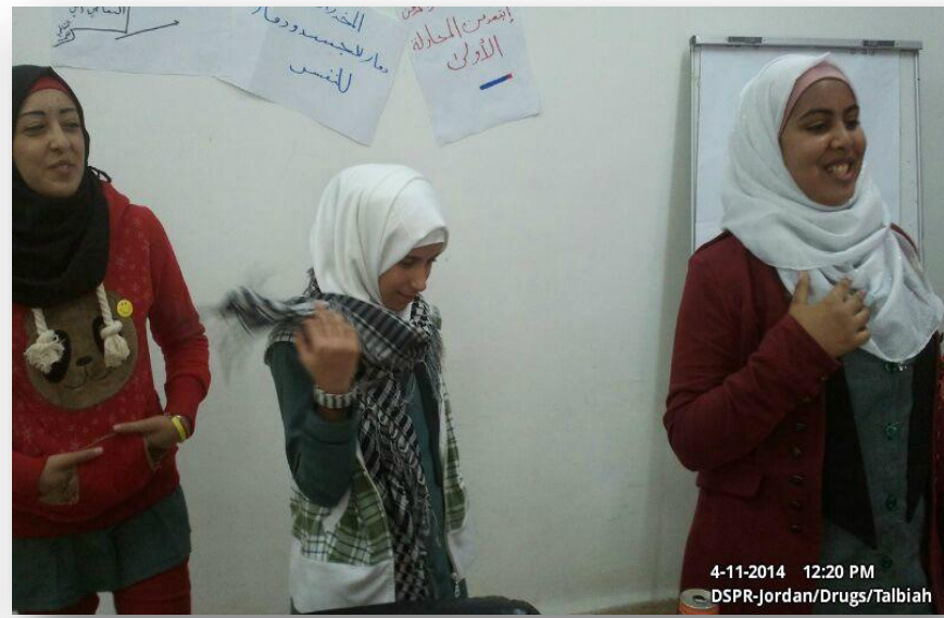
4-11-2014 12:20 PM DSPR-Jordan/Drugs/Talbiah