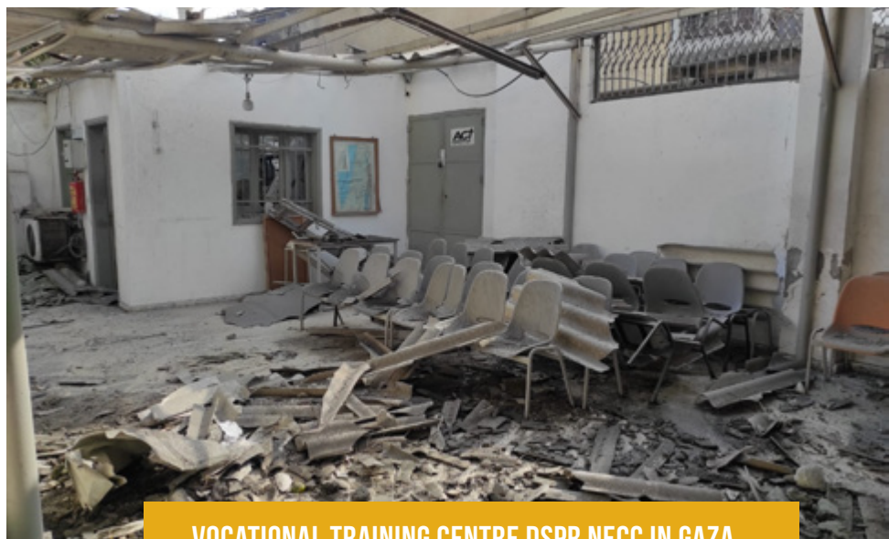
VOCATIONAL TRAINING CENTRE DSPR NECC IN GAZA