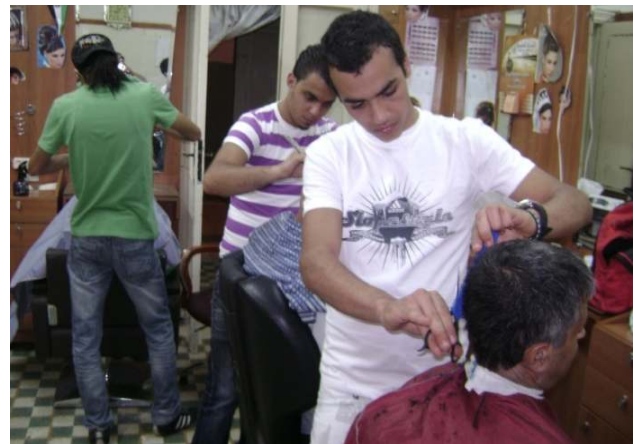
Future barbers in JCC Centers