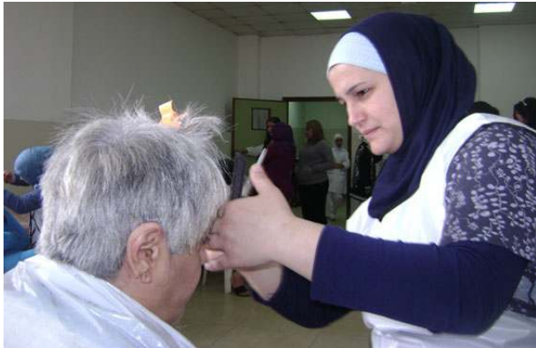
Cutting and styling in the old people's home

In a nearby home for the elderly are more than 50 women who await anxiously the care and the company of the girls from our Center. An agreement with the administration allows our girls to attend to all the grooming needs of the ladies in the home from cutting hair to applying makeup to cutting and polishing nails.