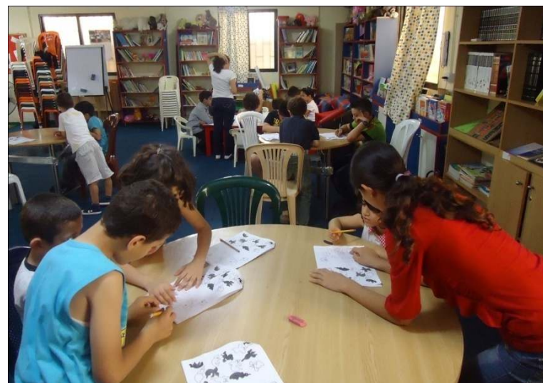
Children reading and drawing at Dbayeh Community Center

The library has become a meeting place for the whole community where young and old meet to plan the many activities run in the camp. It has truly become a community center, a center for culture where the lights shine way into the night.