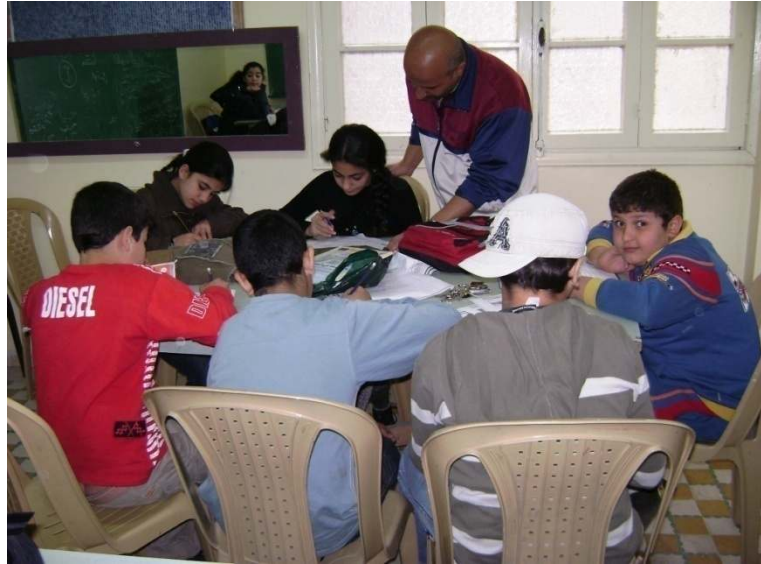
Tutoring class at Sabra Center

work with them to insure that they understand the assigned materials and fulfill their requirements. Grades given by their schools are always checked as an indication of progress or need for harder work. An average of 35 to 45 students, benefit yearly from this program.