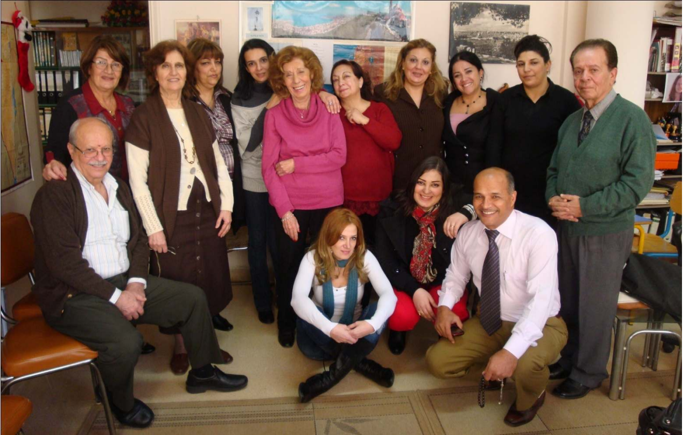
JCC School staff