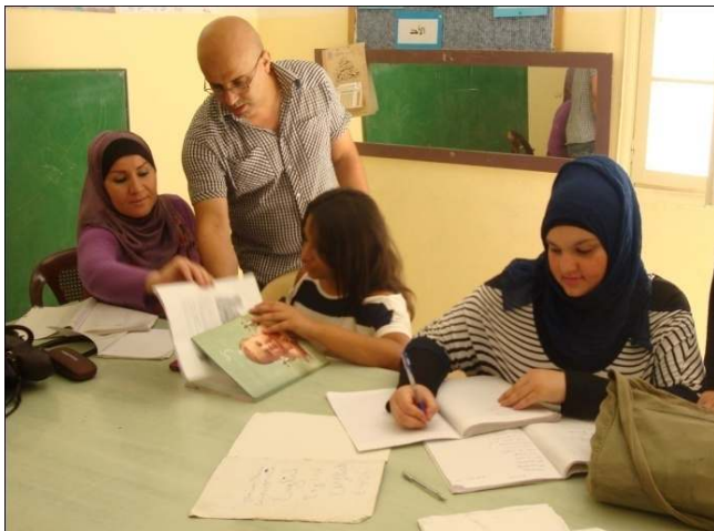
English Lesson at Sabra Center

In Sabra , the students of English have a different purpose. Eight young women took the course so as to improve their chances of finding jobs.