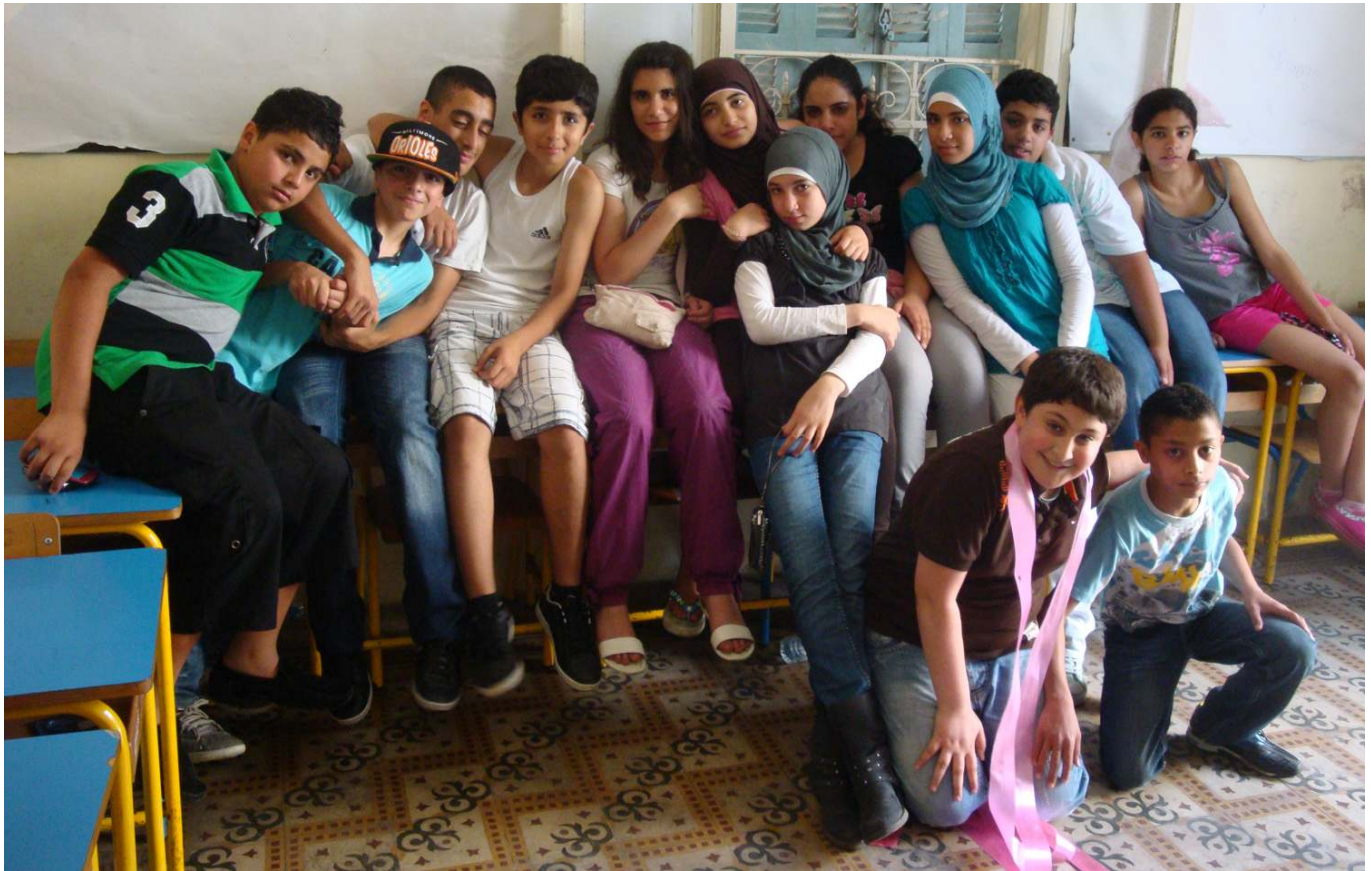
JCC School Students