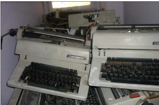
JCC's old typewriters

women have become proficient enough to seek employment. Some though prefer to further improve their English so as to seek better jobs.