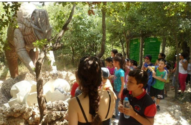
Trip to Dinocity the Dinosaurs Zoo