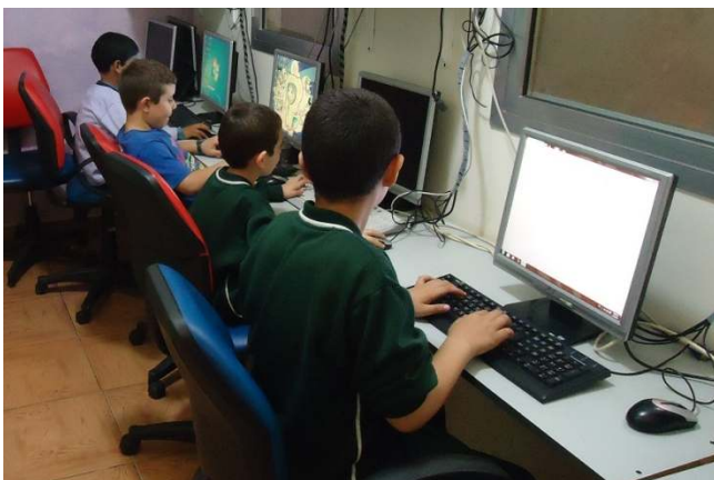
Computer Room at Dbayeh Center

The Dbayeh Library/Community Center is well equipped with computers. The students taking the tutorial program have learned to use the computers in researching for their studies. Introduction to computer courses are open to the community and especially to library members. "For Women Only" is a computer course in Sabra center. This came at the request of some