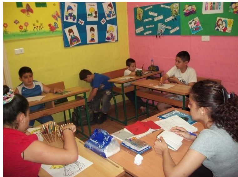
Tutoring class at Dbayeh Center

Dbayeh Center: The program is known as the "Study Station" where an average of 31 to 36 students gather after school to work on their home work. They come from 9 different schools with their different syllabi. Five tutors work with them while those with learning problems and defects get specialized care.