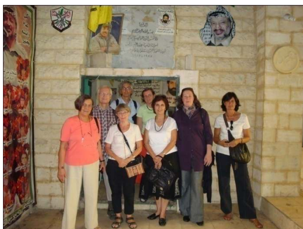
German and Danish pastors attending a special theology course at the Near East School of Theology, who wanted to see and feel the refugee situation

The JCC participates and supports activities organized by others that fight for civil rights of the refugees such as the right to work and the right of return. The youth are also made aware of their human rights and are taught to pursue these rights.