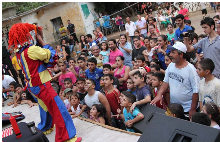
Summer Carnival at JCC Dbayeh

Dbayeh camp waits anxiously for the mid-summer carnival which has been taking place for the last four years. This event draws the whole community together as they plan and prepare for this 3 day activity. Music, dances, poetry recitals, plays, competitions, face painting, games and food are all part of the program. The carnival is open to adjoining communities and special invitations go to the other camps.