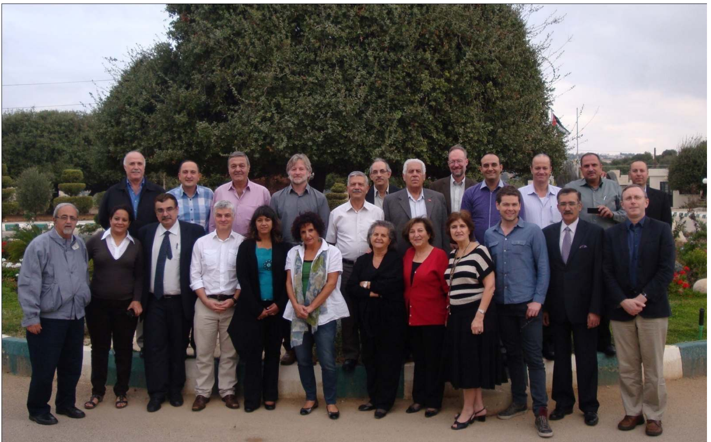
Round Table Meeting Jordan